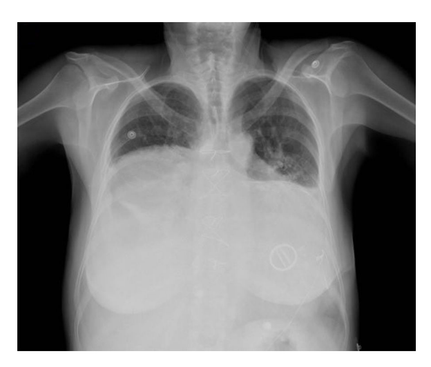
Figure 1 Chest X-ray with giant cardiac silhouette, sternal suture and mechanical mitral valve.

A 55-year-old woman arrived at the emergency room with dyspnea and generalized edema. The patient had as relevant medical history, a mechanical mitral valve, severe tricuspid regurgitation, pericardiectomy apparently due to recurrent pericardial effusion, atrial fibrillation and a pacemaker for complete atrioventricular block. Physical examination revealed signs of right-sided heart failure and tricuspid regurgitation. The chest X-ray (Figure 1), echocardiography and computed tomography (Figure 2) revealed a giant right atrium (18 cm \times 15.3 cm \times 16.3 cm) and giant left atrium (13.1 cm×9.6 cm×9.1 cm). Right and left ventricles had normal size and function. She also had severe tricuspid regurgitation and a normally functioning mitral prosthesis. The atria were so large that they were causing pulmonary restriction and dyspnea that was difficult to manage. The patient presented progressive deterioration during hospitalization and despite heart failure treatment she died.