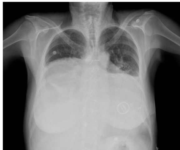
Figure 1 Chest X-ray with giant cardiac silhouette, sternal suture and mechanical mitral valve.

A 55-year-old woman arrived at the emergency room with dyspnea and generalized edema. The patient had as relevant medical history, a mechanical mitral valve, severe tricuspid regurgitation, pericardiectomy apparently due to recurrent pericardial effusion, atrial fibrillation and a pacemaker for complete atrioventricular block. Physical examination revealed signs of right-sided heart failure and tricuspid regurgitation. The chest X-ray (Figure 1), echocardiography and computed tomography (Figure 2) revealed a giant right atrium (18 cm×15.3 cm×16.3 cm) and giant left atrium (13.1 cm×9.6 cm×9.1 cm). Right and left ventricles had normal size and function. She also had severe tricuspid regurgitation and a normally functioning mitral prosthesis. The atria were so large that they were causing pulmonary restriction and dyspnea that was difficult to manage. The patient presented progressive deterioration during hospitalization and despite heart failure treatment she died.