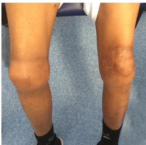
Figure 2 Bilateral arthropathy of the knees.

and evolving to pain at rest (Class IV of the Canadian Cardiology Society. The patient had been started on ASA 100mg/day in Cape Verde and at the time of assessment, he was asymptomatic. The objective examination showed no other alterations apart from evidence of bilateral arthropathy at the knee (Figure 2). Laboratory analyses, in particular, prothrombin time and platelet count, were normal and activated partial thromboplastin time >100 seconds, FVIII <1% and FVIII inhibitors were negative. Myocardial necrosis mark-