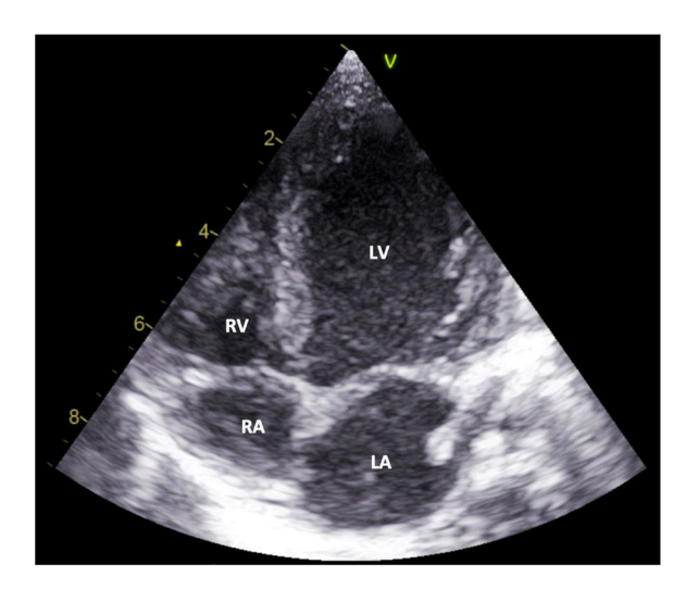
Figure 2 Transthoracic echocardiography (4-chamber view), with severe dilatation of the left atrium and left ventricle. LA: left atrium; LV: left ventricle; RA: right atrium; RV: right ventricle.