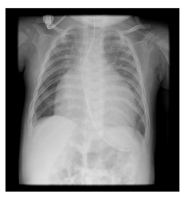
Figure 1 Chest radiography showing cardiomegaly and pulmonary congestion.

We report the case of a four-month-old infant with Down's syndrome referred for observation due to progressive tachypnea and failure to thrive. Chest radiography revealed cardiomegaly and pulmonary congestion (Figure 1). Transthoracic echocardiography showed severely dilated left-sided chambers with global systolic dysfunction, but was inconclusive regarding the underlying abnormality due to the patient's poor acoustic window (Figure 2). On cardiac catheterization, the child was found to have a 10 mm long, 3.8 mm wide patent ductus arteriosus, anatomically unsuitable for percutaneous closure, and a hypoplastic left coronary artery (Figure 3). The patient underwent an uneventful surgical ligation of the ductus via lateral thoracotomy and was discharged after six days. One month later, the child was admitted to the pediatric ICU with respiratory failure requiring mechanical ventilation. Transthoracic echocardiography revealed a severely dilated left ventricle with dyskinesia of