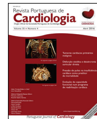
IMAGE IN CARDIOLOGY