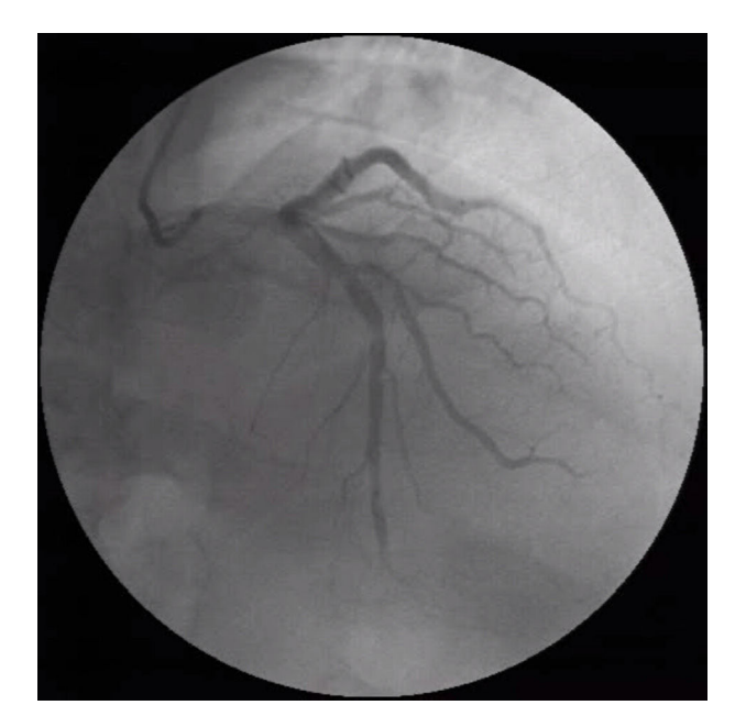
Figure 1 Coronary angiography with slow flow and non-obstructive disease.

neurology workup led to the diagnosis of familial amyloidotic polyneuropathy (FAP), and the Val30Met mutation in the transthyretin (TTR) gene was detected.