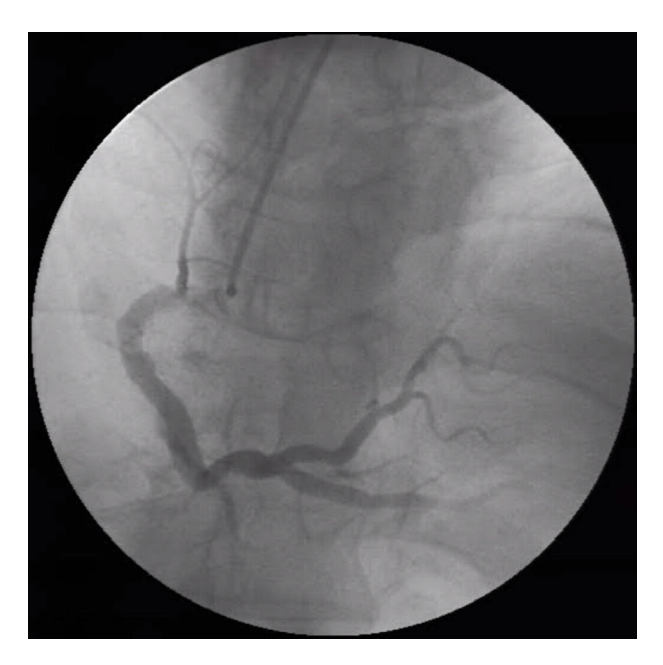
Figure 2 Coronary angiography with slow flow and non-obstructive disease.

The following year, he developed NYHA class II to III congestive heart failure (HF), requiring uptitration of diuretics. The repeat echocardiogram showed moderate concentric left ventricular hypertrophy, with preserved ejection