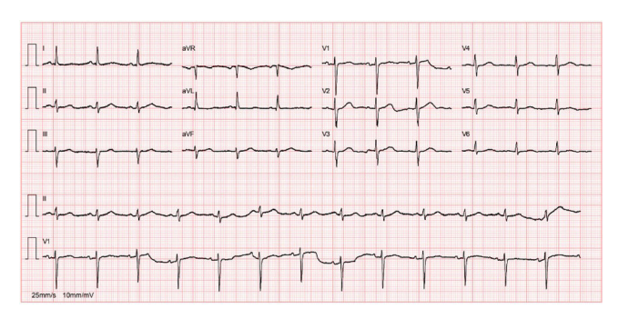
Figure 1 Baseline electrocardiogram performed during cardiology follow-up consultation: sinus rhythm, without pathological Q waves or major ST-T changes.

On March 16, 2020, due to fever and vomiting, she was tested for SARS-CoV-2 and the result was positive; a