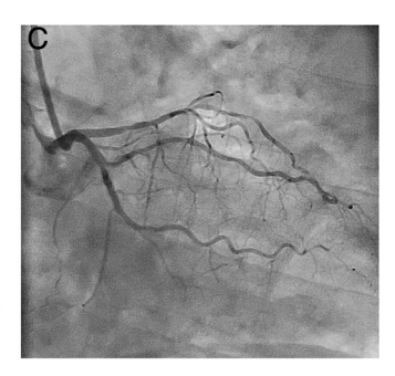
Figure 3 Emergent coronary angiography. (A) Right coronary artery with moderate disease in mid segment and mild disease in distal segment; (B and C) left main coronary artery with no significant lesions; left anterior descending artery with diffuse disease; left circumflex artery with mild disease and stent in mid segment without restenosis.

showed a good result of the previous angioplasty and nonobstructive coronary artery disease (Figure 3).