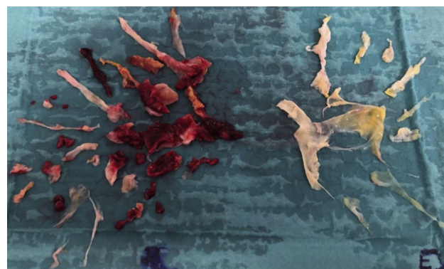
Figure 3 Surgical specimen from patient 3. Note the large quantity of clot casts and webs removed, which, together with the reduction in pulmonary artery pressure confirmed immediately after surgery, led us to expect a good outcome. However, the patient did not survive.

After direct closure of the pulmonary arteriotomies with 5-0 nylon sutures, patients are fully rewarmed and weaned off cardiopulmonary bypass. Inotropic support is used according to our protocol, typically in low to moderate dosages. Meticulous hemostasis is achieved.