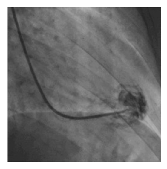
Figure 1 Contrast injection into the left ventricle after guide catheter placement.

Afterwards, a 7.5 Fr (external diameter 6 Fr) Asahi Eaucath sheathless guide catheter was advanced over a standard 0.035" J wire to the ascending aorta. An MP 1 or JR 3.5/4 curve was used according to operator choice. The dilator was removed and a 5 Fr pigtail catheter was then used inside the 7.5 Fr for crossing the aortic valve and safely''landing'' in the left ventricle. The guide catheter was advanced over the pigtail, which was then removed, and placed in the mid-cavity of the left ventricle. The catheter was connected to the pressure system, initial LV pressure was recorded and a minimal amount of contrast was injected (Figure 1). A 5.5 Fr Cordis 104 cm or 5.4 Fr Maslanka 120 cm bioptome was advanced and the myocardial wall was sampled (Figure 2). Back-bleed from the catheter and, if necessary, aspiration, were then performed to ensure no air bubbles were in the system. These steps were then repeated several times until the desired number of samples