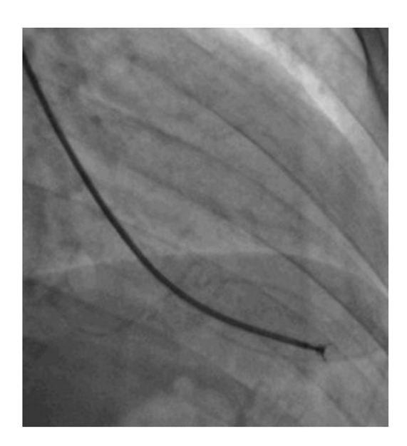
Figure 2 Bioptome deployment with open forceps, immediately before sampling.

was obtained – a minimum of five – of which at least one was frozen for further analysis, if necessary.