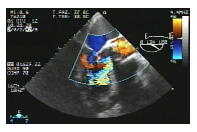
Figure 2 Transesophageal echocardiography, long-axis midesophageal view, showing severe eccentric aortic regurgitation.