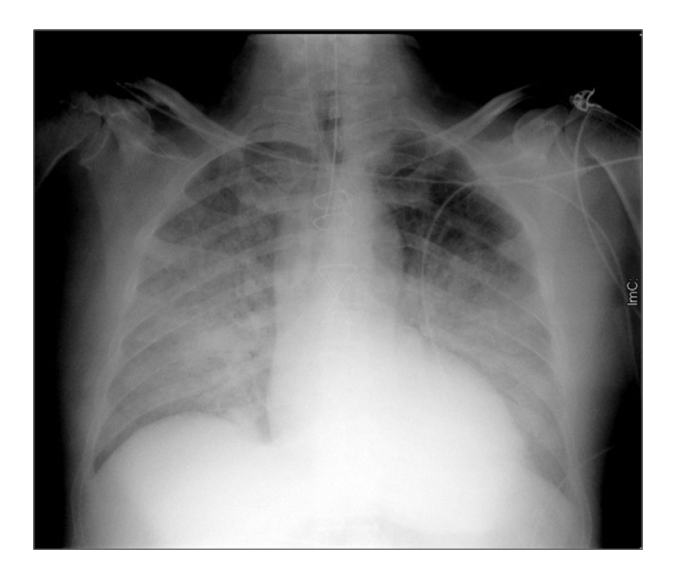
Figure 1 Chest X-ray showing cephalization of pulmonary veins and indistinctness of the vascular margins. The heart is enlarged.

In view of the Society of Thoracic Surgeons (STS) predicted 30-day mortality score of 13% and a EuroSCORE II of 28%, our heart team decided on urgent TAVI, with a valvein-valve procedure through a transapical approach.