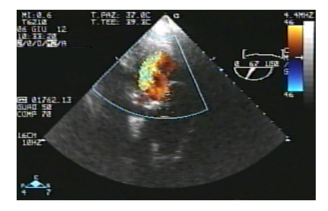
Figure 3 Transesophageal echocardiography, transgastric view.

Figure 2 Transesophageal echocardiography, long-axis midesophageal view, showing severe eccentric aortic regurgitation.