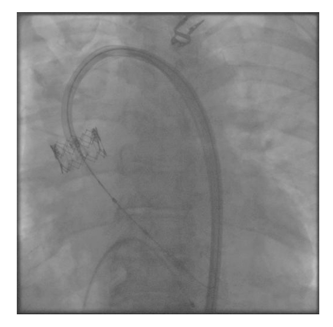
Figure 2 Fluoroscopic image of embolization of the Edwards SAPIEN prosthesis.