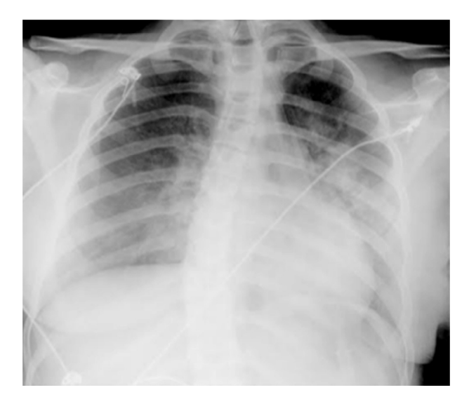
Figure 1 Chest X-ray at admission showing acute pulmonary edema.

and captopril, with dopamine to optimize renal function (maximum 2 \mu g/kg/min ) and digoxin in the first 24 h.