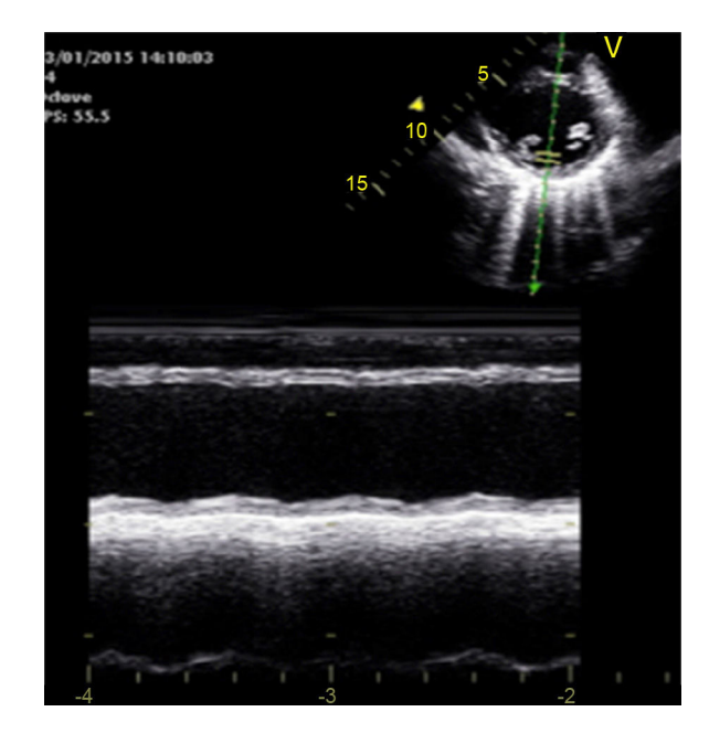
Figure 2 Echocardiogram at admission, short-axis parasternal view, showing global left ventricular hypocontractility.

The authors describe the case of an adolescent girl who, in the context of emotional stress triggered by anesthesia