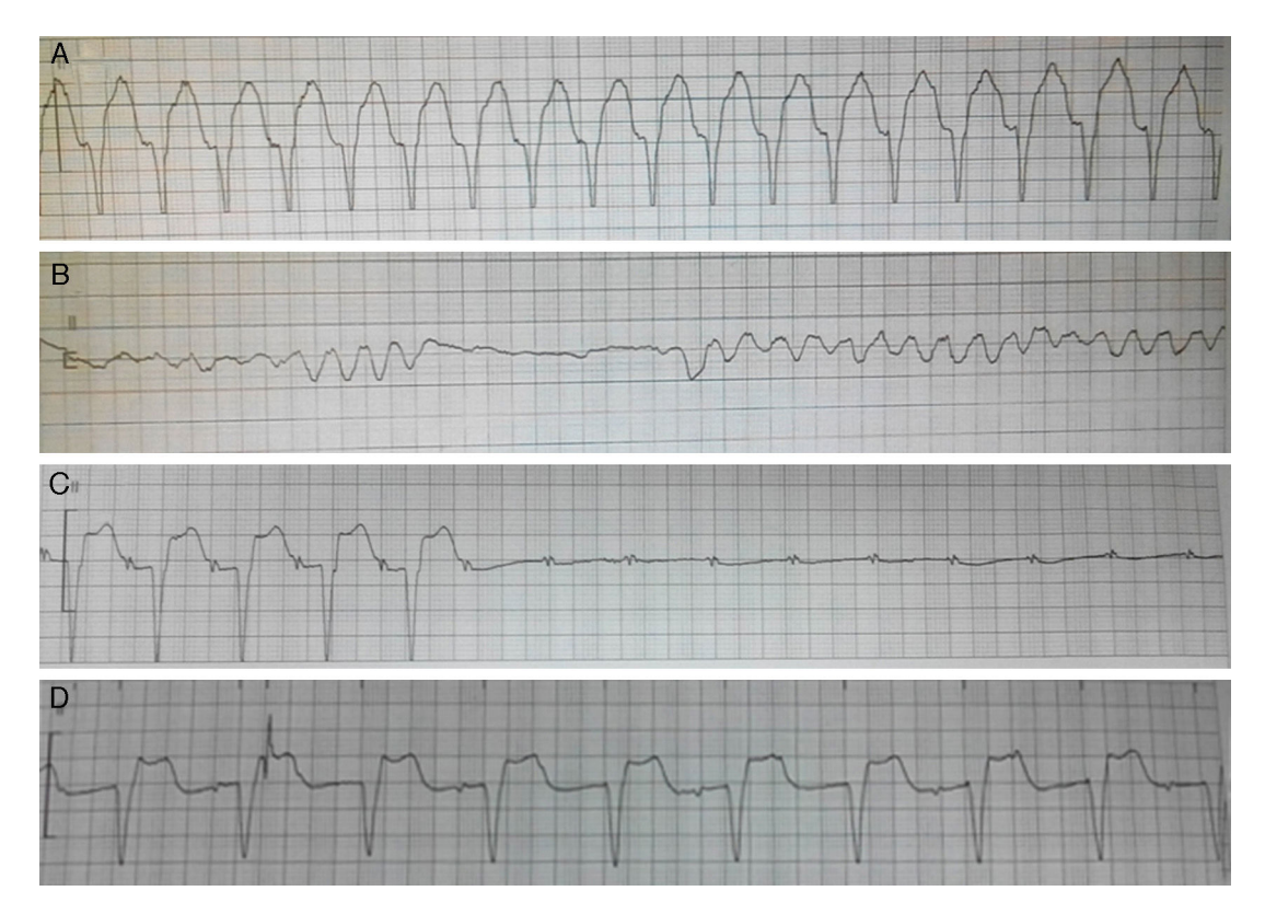
Figure 3 Representative ECGs (lead II) of various arrhythmias and of pacemaker recorded by the ECG monitor during hospitalization. (A) Ventricular tachycardia; (B) ventricular fibrillation; (C) high-degree atrioventricular block; (D) ventricular pacing by temporary pacemaker.

Overall, we conclude that coronary angiography is still the most effective approach to differentiating fulminant myocarditis from acute myocardial infarction. Timely and aggressive interventional measures may significantly reduce the risk of sudden death from cardiogenic shock or lifethreatening arrhythmias in fulminant myocarditis.