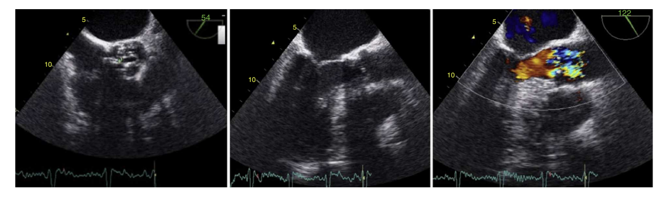
Figure 4 Transesophageal echocardiography: (left) malformed aortic valve with area calculated by planimetry of 0.6 cm<sup>2</sup>; (center) left ventricular outflow tract without visible obstruction; (right) color Doppler differentiating laminar flow in the left ventricular outflow tract and turbulent flow through the aortic valve, confirming obstruction at the level of the valve.