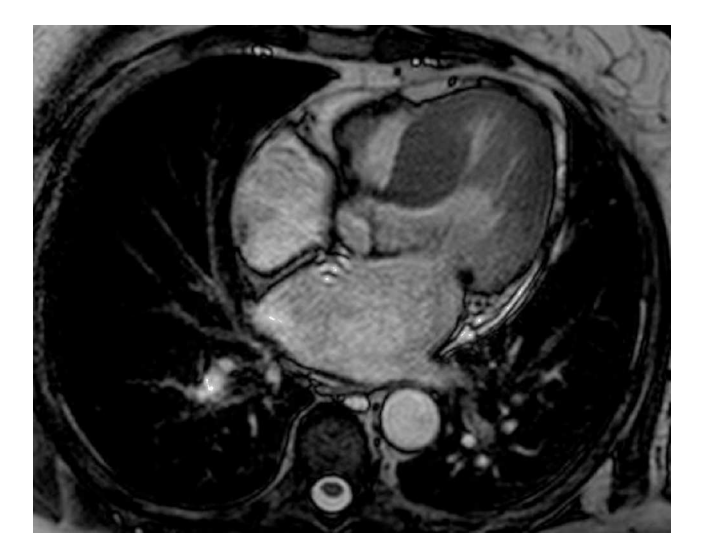
Figure 2 Cardiac magnetic resonance imaging showing marked hypertrophy of the basal and mid interventricular septum (22 mm) and moderately dilated left atrium (area 33 cm<sup>2</sup>).

level at which flow acceleration occurs,<sup>8</sup> but TTE does not always provide definitive information.