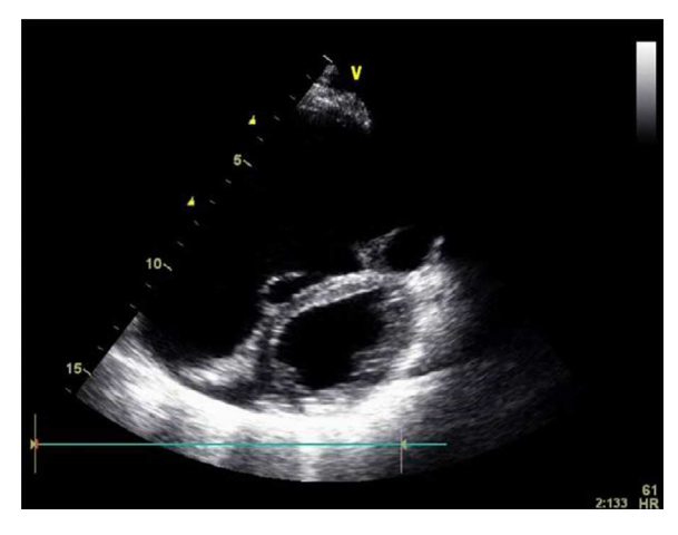
Figure 3 Transthoracic echocardiography: severe dilatation of the right chambers. Flattening of the ventricular septum during diastole suggests volume overload.