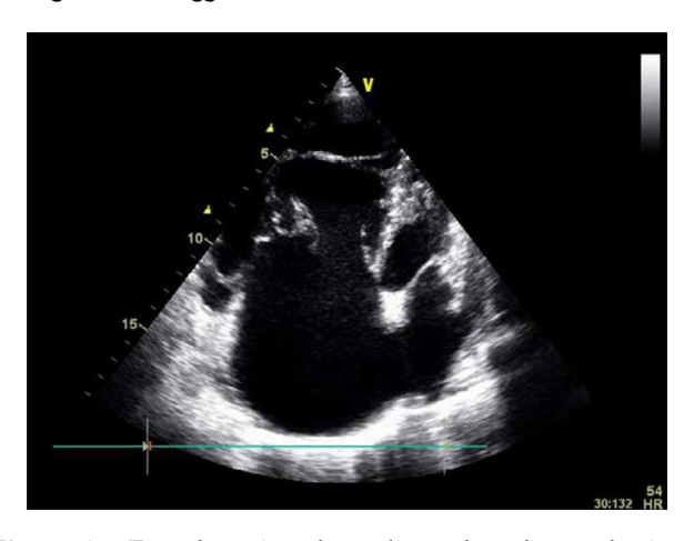
Figure 4 Transthoracic echocardiography: abnormal tricuspid valve with dysplastic and asymmetric leaflets and high implantation of the septal leaflet (> 8\,\text{mm/m}^2 downstream of the atrioventricular junction).