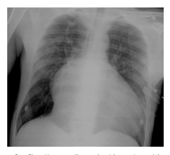
Figure 2 Chest X-ray: cardiomegaly with prominent right cardiac silhouette (marked dilatation of the right atrium) and left convexity suggests dilatation of the right ventricular outflow tract.

(paradoxical embolism), it was decided to start anticoagulation therapy. After cardiac catheterization, which excluded significant coronary artery disease, the patient underwent surgical correction (tricuspid valve repair with ring placement, right ventricular plasty and patent foramen ovale closure), without complications and with subsequent clinical improvement.