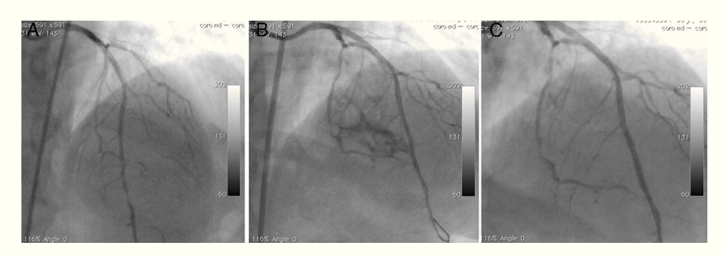
Figure 2 A long, calcified, and eccentric critical lesion in the mid to distal left anterior descending coronary artery (A); type II perforation showing limited extravasation with some myocardial blushing (B); no myocardial blushing is seen on the control angiogram after covered stenting (C).

The fourth patient was a 74-year-old woman who went to the emergency department with new-onset severe chest pain and was diagnosed with acute anterior myocardial infarction. She was transferred to the catheterization laboratory for primary PCI. Long, thin, angulated and eccentric critical sequential lesions with thrombus were detected in the mid to distal portion of the LAD (Figure 4A). After stenting followed by balloon predilatations, prominent contrast flow into the left ventricle was detected on CAG, indicating type IV coronary rupture (Figure 4B). A covered stent was immediately implanted in the ruptured area and anticoagulation was reversed. Control CAG showed no extravasation around the target area (Figure 4C). The echocardiogram