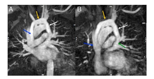
Figure 3 (A and B) Multiplanar angiographic reconstruction. Blue arrow – superior vena cava; yellow arrow – innominate vein; white arrow – anomalous vertical pulmonary vein; green arrow – left pulmonary veins.

Diagnosis of PAPVR should be followed by screening for other congenital defects and assessment of its functional impact, for which CMRI is particularly useful. This anomaly may have a similar appearance to persistent left superior