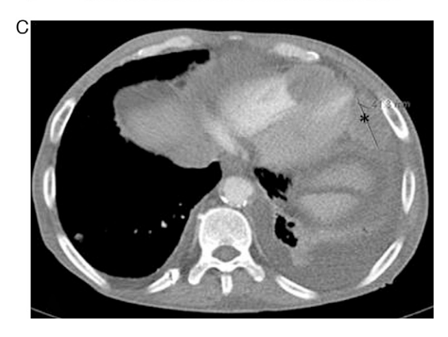
Figure 3 Computed tomography showing a right ventricular mass (arrow), infiltrating the free wall (A) and interventricular septum (B), as well as a mass (*) attached to the pericardium adjacent to the left ventricle (C).

echocardiography in order to determine the histological characteristics of the tumor and decide on appropriate therapy.<sup>7</sup>