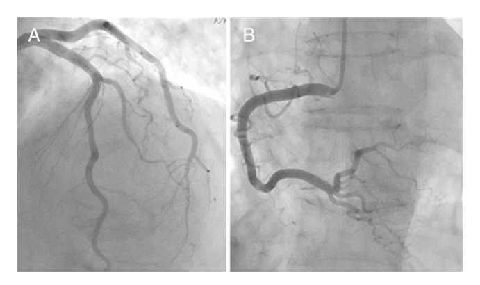
Figure 3 Cardiac catheterization in a patient with takotsubo cardiomyopathy showing normal coronary arteries. (A) Left coronary artery; (B) right coronary artery.

These characteristics are the key to differentiating TC from other reversible conditions that have similar clinical features and ST-segment elevation, including cardiac syndrome X, Prinzmetal angina, myocarditis and cocaine use.<sup>5</sup>