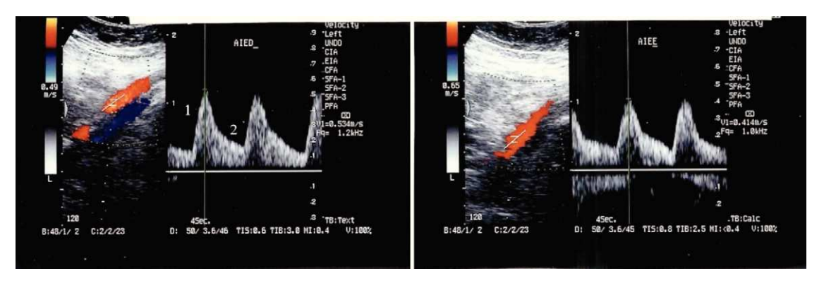
Figure 2 Lower limb arterial Doppler ultrasound showing symmetrically decreased systolic pressure index (1) and persistent blood flow during diastole (2).

However, in 2005, the hypertension became uncontrolled and the patient developed symptoms of heart failure (exertional dyspnea, fatigue, orthopnea) and was referred to the outpatient hypertension clinic. On physical examination she was obese (BMI 35 kg/m<sup>2</sup>), with high blood pressure (170/100 mmHg) in the upper limbs and unmeasurable in the lower limbs due to extreme obesity, and tachycardic, with irregular arrhythmic pulse; cardiopulmonary auscultation revealed arrhythmic heartbeats (with no murmurs) and inspiratory bibasal crackles; and lower limb edema was evident. On initial complementary workup the ECG revealed atrial fibrillation and voltage criteria of LVH, and the echocardiogram disclosed LVH, non-dilated LV with preserved systolic function, mild aortic regurgitation (tricuspid aortic valve) and normal right-side chambers and valves; laboratory tests were normal, including renal function; the renal ultrasound was also normal. Despite treatment with several antihypertensive drug combinations, including ACE inhibitors, ARBs, chlorthalidone, furosemide, spironolactone, beta-blockers and calcium antagonists, her blood pressure remained uncontrolled. At that time another CT