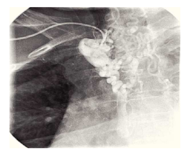
Figure 4 Coronary angiography showing collateral circulation via the mammary artery.

The patient was refused for surgery due to the high surgical risk imposed by the large and long poststenotic dilation.