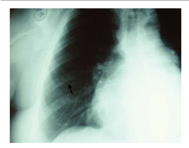
Figure 5 Chest radiograph with inferior rib notching (arrow).