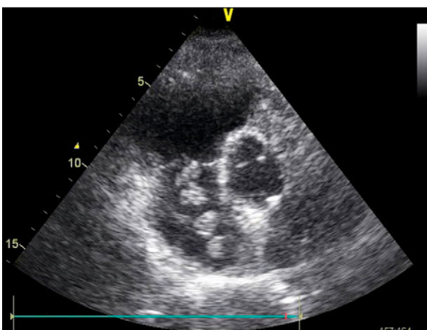
Figures 1 and 2 Multiple thrombi inside the right atrium.