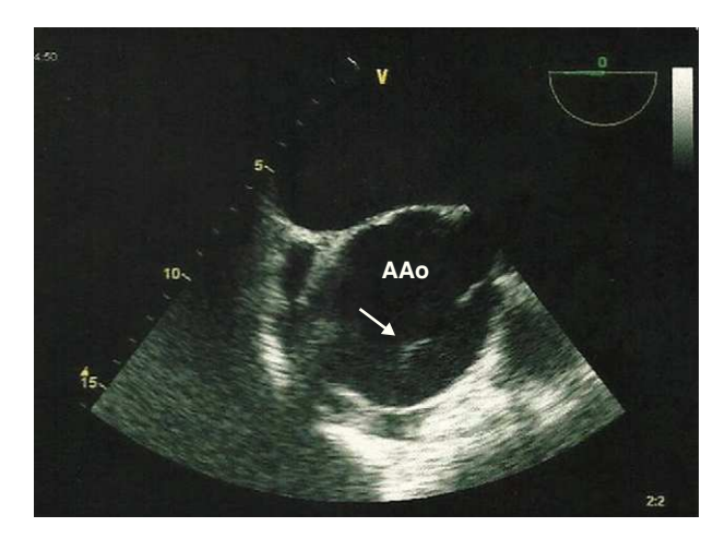
Figure 2 Linear echocardiographic image, short-axis view, suggestive of an intimal flap (arrow). AAo: aortic aneurysm.