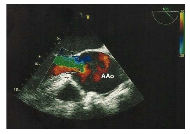
Figure 1 Echocardiographic image of the aortic aneurysm (AAo) with severe aortic regurgitation.

On admission to our hospital the patient was asymptomatic, under therapy with nitrates and beta-blockers and hemodynamically stable. Cardiac magnetic resonance imaging revealed aneurysmal dilatation limited to the aortic root and ascending aorta (maximum transverse diameter 65 mm) and excluded dissection or rupture (Figs. 3 and 4). Preoperative cardiac catheterization excluded coronary disease and aortography, performed at the same time, documented annulo-aortic ectasia (maximum transverse diameter of the ascending aorta 75 mm) (Fig. 5). The patient underwent a Bentall procedure, a