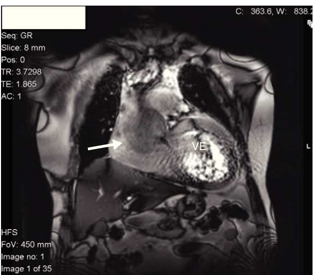
Figures 3 and 4 Annulo-aortic ectasia visualized by cardiac magnetic resonance imaging in short- and long-axis view (arrow), respectively, excluding acute aortic dissection. AAo: aortic aneurysm; AE: left atrium; VE: left ventricle.