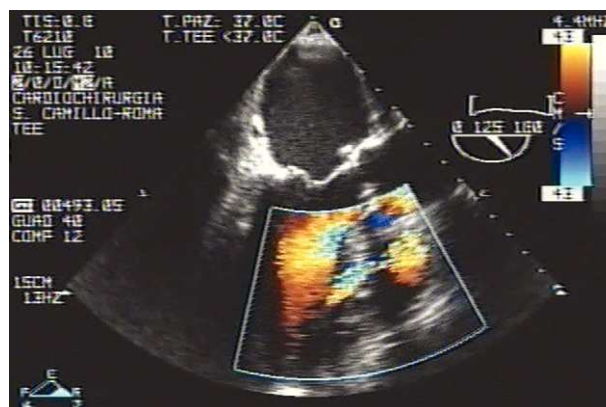
Figure 2 Intraoperative TEE: a clear left-to-right shunt was detected on color Doppler.

Peri-procedural complications may occur in transapical aortic valve implantation (TA-AVI).