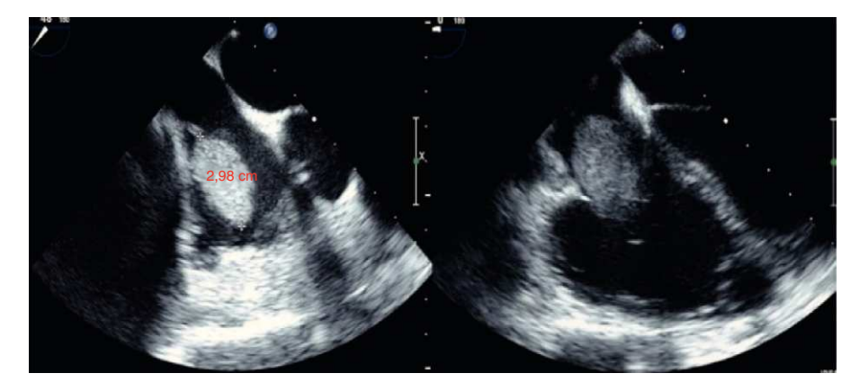
Figure 3 Transesophageal echocardiogram showing a multilobulated mass, apparently pedunculated, measuring around 3 cm, in the right atrium.

In the light of her other prothrombotic risk factors (smoking, morbid obesity and oral contraceptive use), the patient has suspended oral contraceptives, has quit smoking and is taking dietary advice.