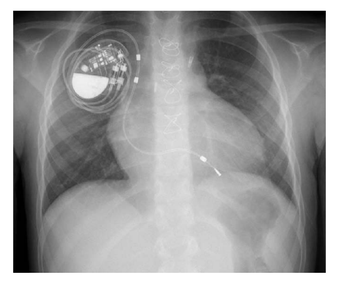
Figure 2 Pacemaker lead without loop in the inferior vena cava and atrial dipole displaced to the superior vena cava, with evidence of ''lead twiddling'' in the pacemaker pocket.