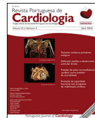
IMAGE IN CARDIOLOGY