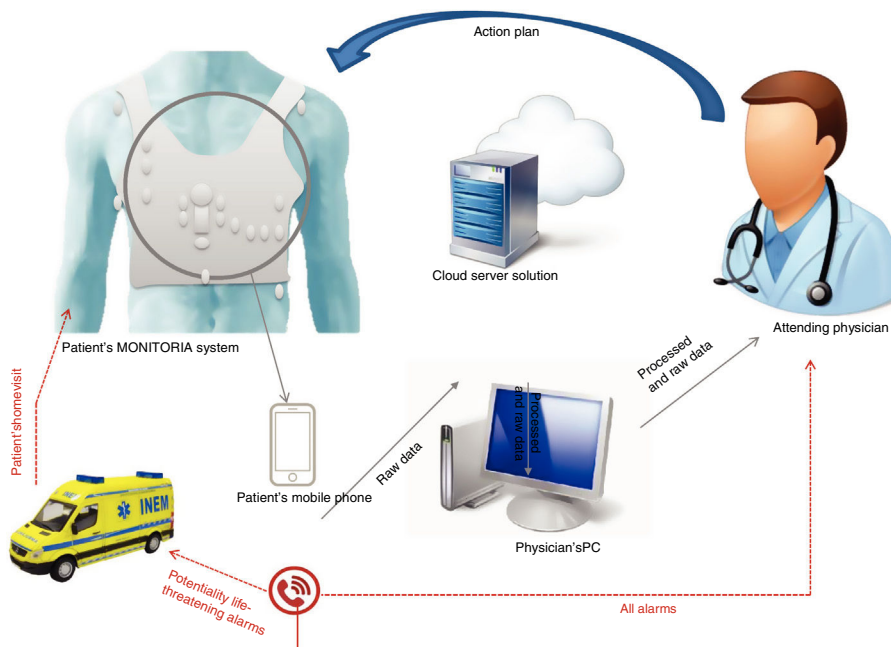
Figure 3 Generic representation of MONITORIA’s remote monitoring system.

In the future, MONITORIA will be able to send shocks or function as a pacemaker to treat certain arrhythmias (ven-