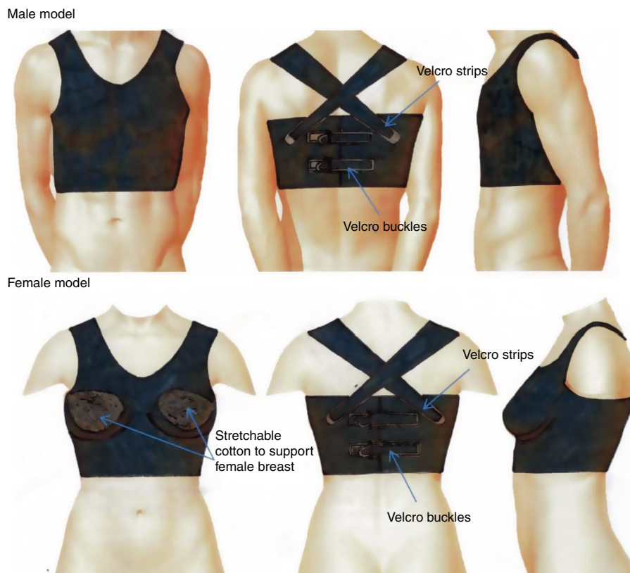
Figure 2 The thoracic vest in which the MONITORIA is embedded.

All the data given by the sensors are recorded transiently in the patient's mobile phone, before being sent to the cloud server. The patient's mobile phone will have an application, specifically developed for MONITORIA, which instructs the patients whenever appropriate. This will inform them of the most suitable time for meals (ensuring the correct measurement of skin sodium content) and giving them the feedback regarding their physical activity, informing them if they have