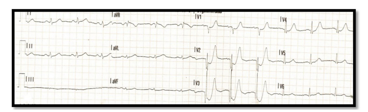
Figure 1 Initial electrocardiogram showing a De Winter pattern (3-6 mm ST-segment depression with high symmetrical T waves in leads V2-V3).

Received 19 September 2019; accepted 27 September 2019 Available online 9 September 2020