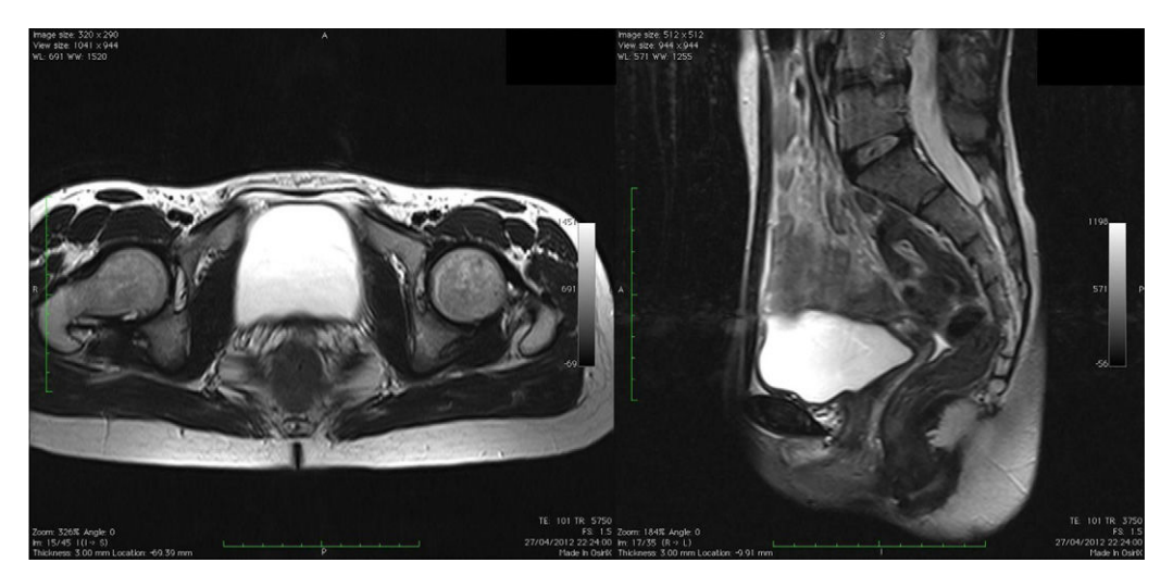
Figure 1 Axial and sagittal pelvic magnetic resonance imaging, showing aplasia of the uterus and the upper part of the vagina.

ASD, especially ostium secundum type, is a common congenital heart defect in adults. It occurs as a result of defective development of the interatrial septum. Most