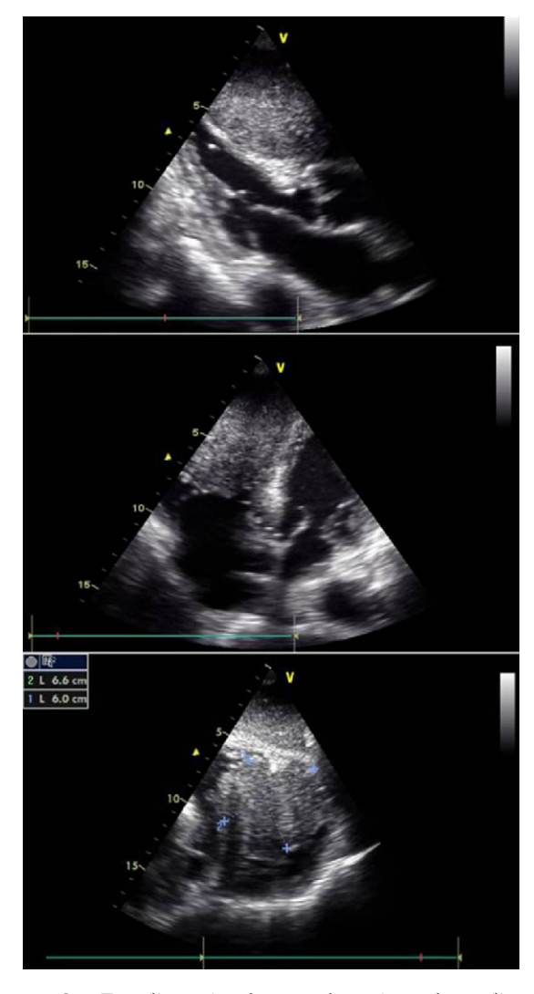
Figure 2 Two-dimensional transthoracic echocardiogram (top: parasternal long-axis view; middle: apical four-chamber view; bottom: subcostal view) showing involvement of the ventricular septum by the mass, which also protrudes into the right ventricular chamber. Maximum dimensions of 60 \text{ mm} \times 66 \text{ mm} assessed in subcostal view.