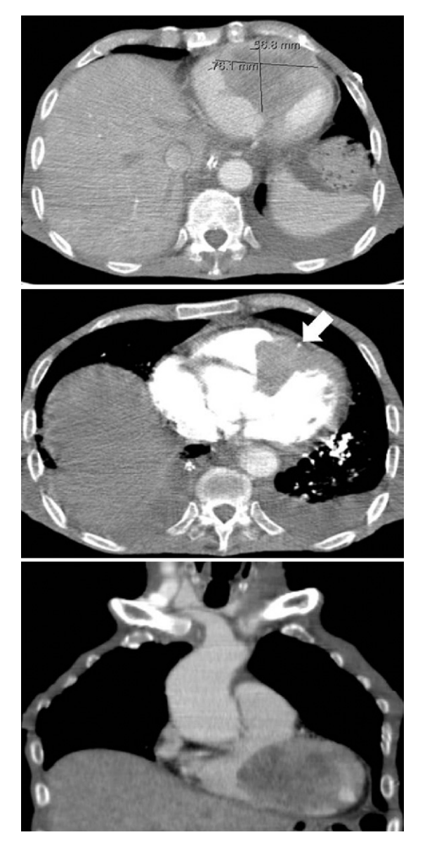
Figure 3 Computed tomography (top and middle: axial plane with and without contrast, respectively; bottom: coronal plane), better defining the extent of the cardiac mass as well as its relation with adjacent structures. Arrow: left anterior descending artery.