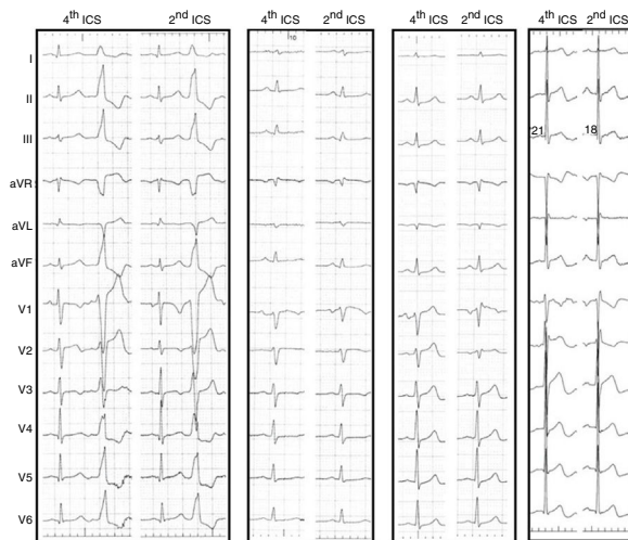
Figure 2 12-lead electrocardiogram (ECG) of four different patients comparing the tracings with V1 and V2 in the standard and high positions. From left to right, in the first patient V1 does not change, the PVC loses R in V1 and V2 in the second ICS. In the second patient the upper ECG displays ST elevation in V1, in the third patient ST elevation with rSr' pattern and in the fourth patient an rSr' pattern without ST elevation. ICS: intercostal space; PVC: premature ventricular contraction.

precordial T-wave inversion in the group with ST elevation (0% vs. 43%, p=0.043 ).