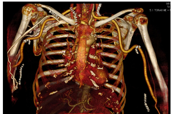
Figure 4 Bilateral carotid-humeral bypass at six-month follow-up (volume rendering).

Giant cell arteritis is a chronic inflammatory systemic disease, affecting medium and large arteries. The most common symptoms arise from the preferential involvement of the cranial arteries, especially branches of the external carotid such as the temporal or ophthalmic artery.