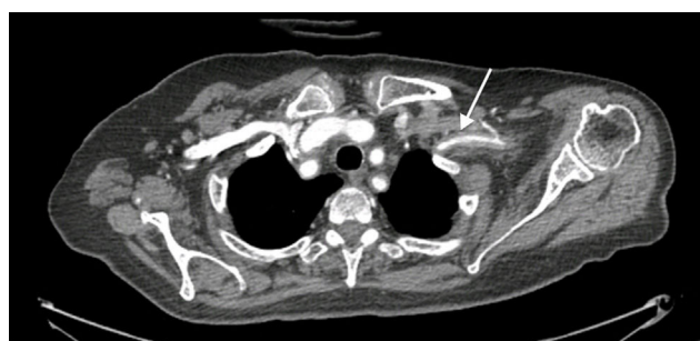
Figure 1 Concentric wall thickening of the left subclavian artery.

The patient immediately started corticosteroid therapy (prednisone 1 mg/kg daily) and aspirin (100 mg