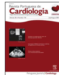
IMAGE IN CARDIOLOGY