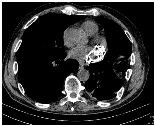
Figure 1 Thoracic computed tomogram showing a large lesion with irregular calcifications.

The echocardiogram showed a rounded mass with calcified walls attached to and slightly compressing the left atrium and the coronary sulcus of the lateral and anterior walls, with apparent fibrocalcification of the myocardium of the basal segment of the lateral wall, which was thinner, hyperechogenic and akinetic (Figure 2). CT angiography showed the lesion high in the pericardial sac in extensive contact with the pericardium, suggesting that its epicenter was within this structure. The lesion appeared to be of