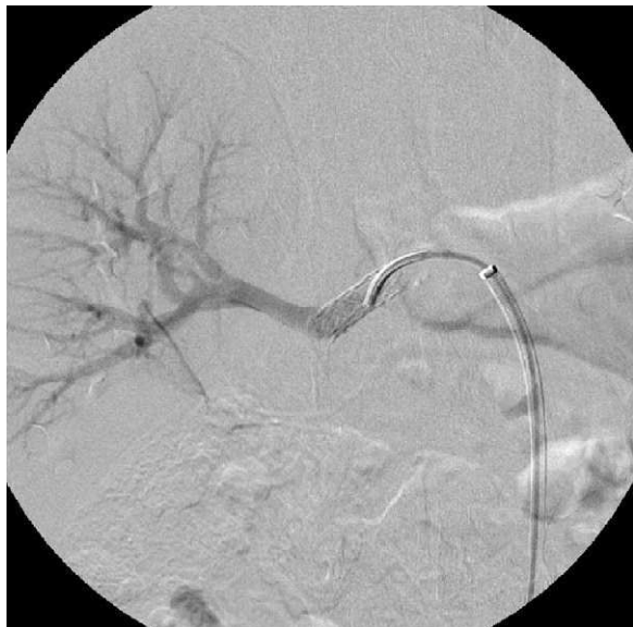
Figure 3 Selective right renal angiography after stent implantation in the superior right renal artery showing exclusion of the aneurysms.