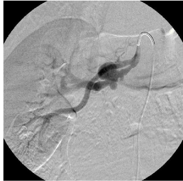
Figure 1 Right renal angiography before stent implantation showing two renal arteries and three saccular aneurysms in the superior artery.

(Figures 2 and 3). The patient was admitted the day before the procedure and was discharged the day after, medicated with 100 mg aspirin and 75 mg clopidogrel/day, as dual antiplatelet therapy. Ten months after the procedure the patient was asymptomatic, with normal blood pressure and without antihypertensive therapy.