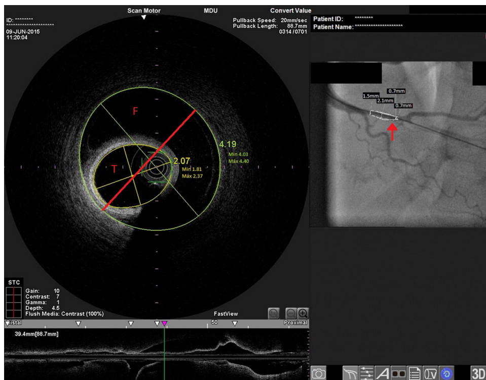
Figure 3 Distal right coronary artery (RCA) viewed by optical coherence tomography (OCT). Location of the OCT frame within the RCA is easily identified on the angiogram (arrow). Although the angiogram projection eventually captured the vessel at its smallest diameter (red line), this should be 4.03 mm as measured by OCT. By angiography the largest diameter of the segment is 2.1 mm. This suggests that the false lumen (F) is filled with a clear fluid, but not contrast, since on the angiogram only the true lumen (T) is visible, corresponding to the 2.07 mm mean true luminal diameter measured by OCT. Moreover, on OCT the catheter can be seen at the center of the vessel, but touching the intimal wall, while on the angiogram it appears adjacent to the wall, suggesting that only the true lumen is visible.

In the recent event, the dissection was evident on angiography, and a conservative approach was adopted, as is common in such cases, with reported good results. 14 The patient was on anticoagulants with the purpose of promoting patency of the true lumen, as is the practice in other centers, with good results. 15 Despite the patient’s clinical