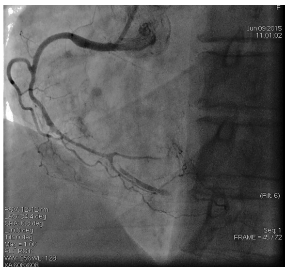
Figure 2 Second angiogram of the right coronary artery, showing a wider false lumen in the posterior descending artery, greater true lumen compromise and worse flow to the posterolateral branches.