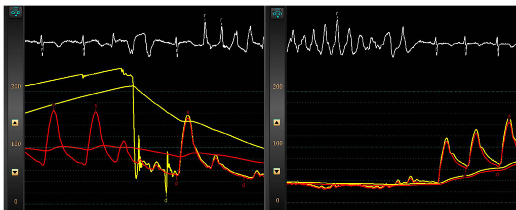
Figure 2 Left: afterdepolarizations and initiation of polymorphic ventricular tachycardia (VT) following adenosine injection. Note the absence of catheter damping or ischemia; right: self-termination of the VT, with restoration of blood pressure and minimal separation between pressure curves (Pd, red curve; Pa, yellow curve). Further adenosine injections demonstrated a minimum fractional flow reserve of 0.93 (non-significant).