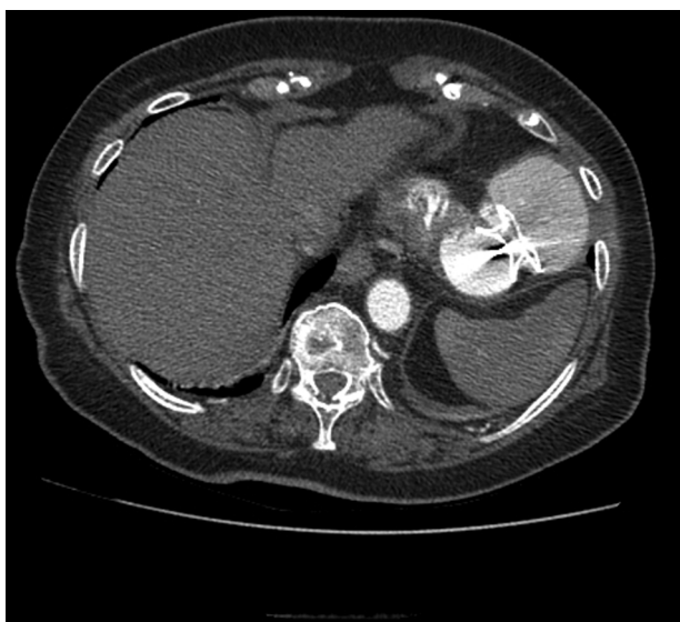
Figure 4 Computed tomography angiography (axial view) showing the Amplatzer® ASD device six months after the procedure.

Finally, a 24 mm Amplatzer® ASD occluder was implanted in a stable position, closing the free wall defect (Videos 4-7).