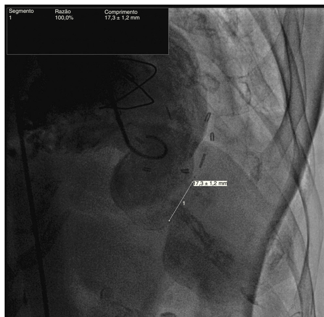
Figure 2 Left ventricular angiography showing a large left ventricular wall pseudoaneurysm with a defect in the ventricular wall.