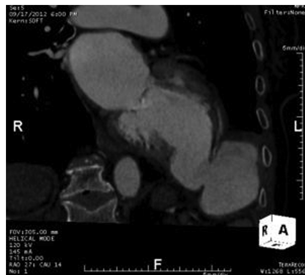
Figure 1 Computed tomography angiography showing a large left ventricular wall pseudoaneurysm with a defect in the ventricular wall.

An initial attempt at a retrograde approach (through the left femoral artery) was unsuccessful because the delivery sheaths were too small, so an anterograde approach was adopted. A 260 cm 0.35" hydrophilic wire (ZIPwire®) was positioned retrogradely in the left atrium with an Amplatz left diagnostic catheter from the left femoral artery. After transseptal puncture through the right femoral vein, this wire was snared and brought into the inferior vena cava (Video 1). From the right jugular vein, the wire was then snared a second time and exteriorized