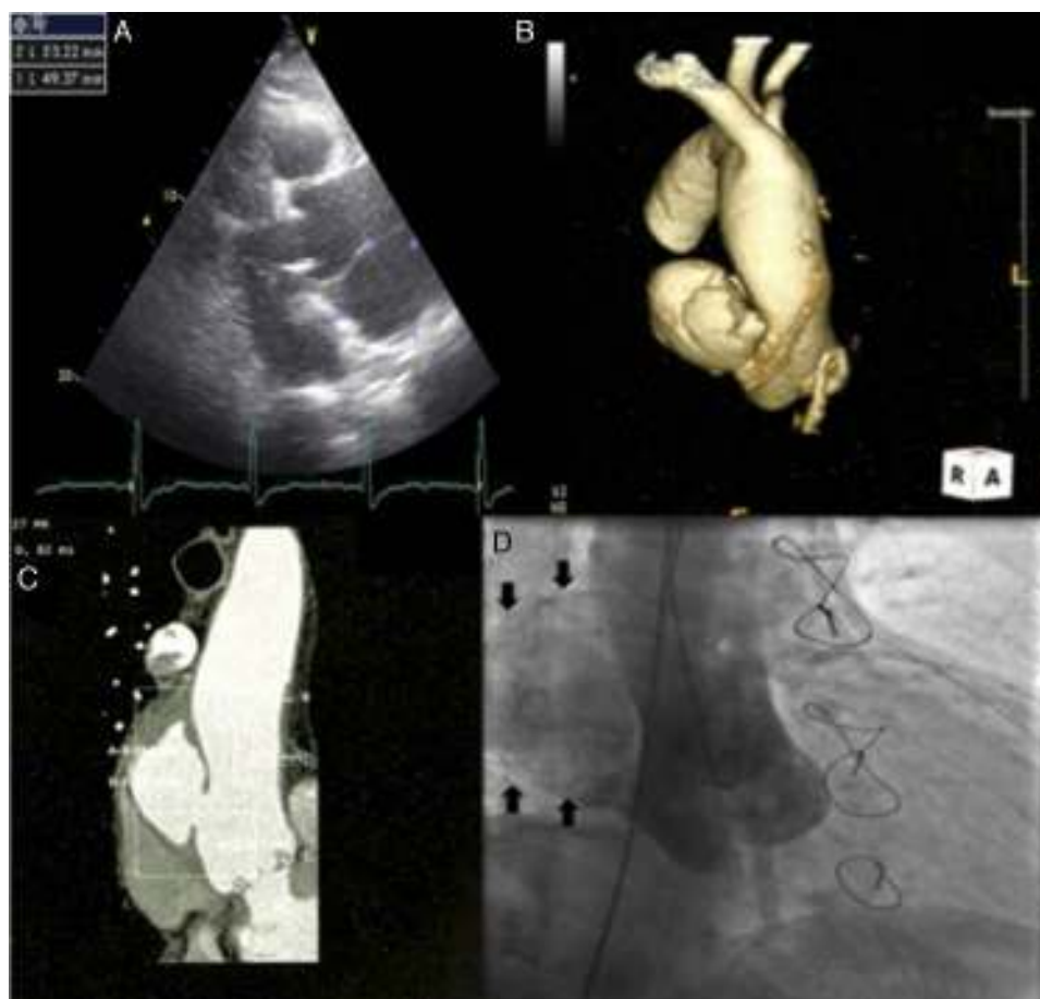
Figure 1 Imaging of ascending aortic pseudoaneurysm. (A) Transthoracic echocardiography showing ascending aortic pseudoaneurysm in parasternal view; (B) three-dimensional computed tomography (CT) reconstruction of aorta; (C) CT scan with intravenous contrast showing the dimensions of the neck and cavity of the pseudoaneurysm; (D) aortography with contrast opacification of pseudoaneurysm cavity (solid arrows).

Surgical repair of this complication is the conventional treatment, but it is associated with very high morbidity and mortality (mortality can reach 46%) and in some cases is not even feasible (due to the technical difficulties in