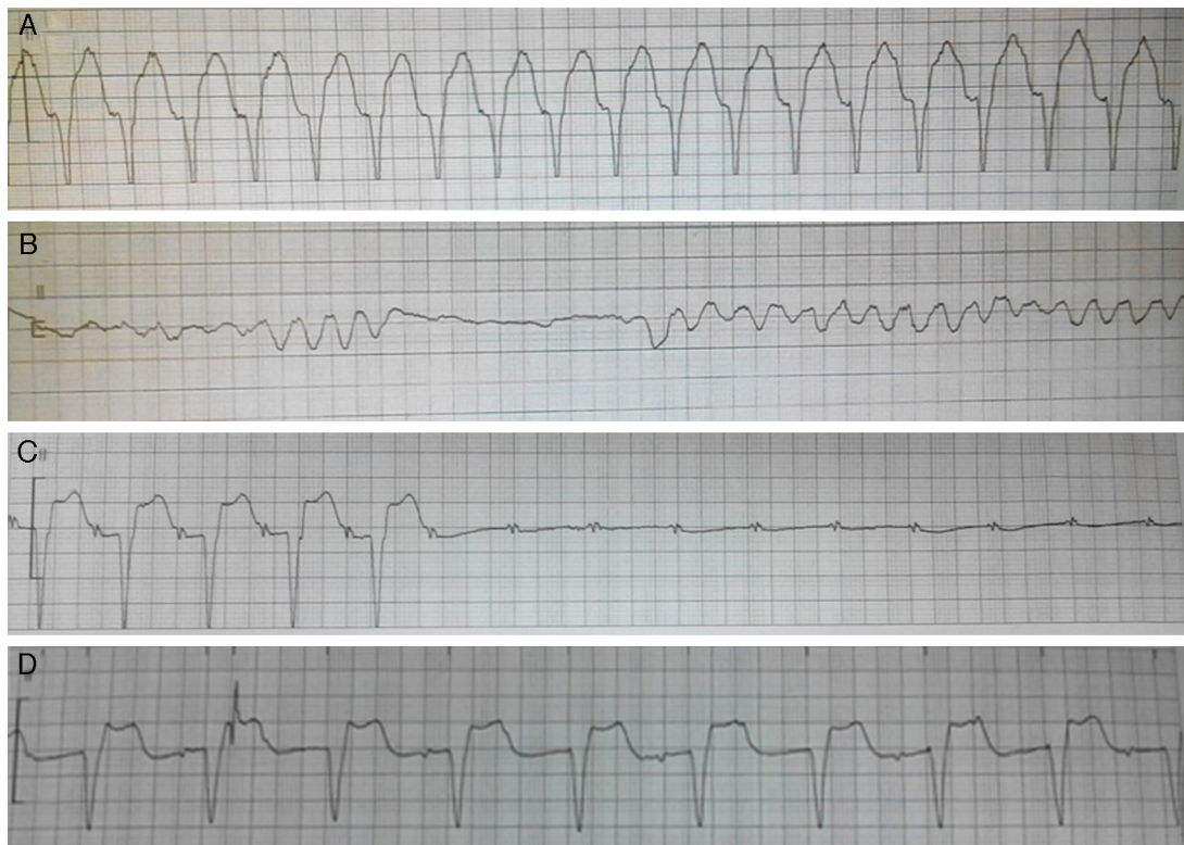
Figure 3 Representative ECGs (lead II) of various arrhythmias and of pacemaker recorded by the ECG monitor during hospitalization. (A) Ventricular tachycardia; (B) ventricular fibrillation; (C) high-degree atrioventricular block; (D) ventricular pacing by temporary pacemaker.

Overall, we conclude that coronary angiography is still the most effective approach to differentiating fulminant myocarditis from acute myocardial infarction. Timely and aggressive interventional measures may significantly reduce the risk of sudden death from cardiogenic shock or life-threatening arrhythmias in fulminant myocarditis.