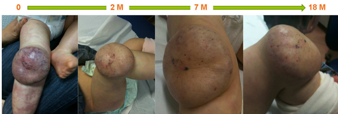
Figure 3 A ten-month-old boy with hemangioma on the right patella and upper right leg, showing a fair response after 18 months of therapy. M: months.

change in color, associated with palpable tissue softening. Other suggestions are down-regulation of proangiogenic signals such as VEGF, bFGF, MMP-9 and HBMEC, and induction of apoptosis in proliferating capillary endothelial cells. 25,26 A large international randomized clinical trial is underway, but many are already advocating its use as a first-line treatment for infantile hemangiomas, in terms of both safety and efficacy. 21,27 Its effects were first discovered by chance by Léauté-Labrèze et al. in 2008. 17 Subsequent