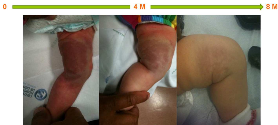
Figure 2 A two-month-old boy who presented with hemangioma on the left thigh, showing complete involution of the lesion on thigh and scrotum after eight months of therapy. M: months.

a highly effective therapeutic option for infantile hemangioma and its complications. 18,21-23 Furthermore, it has been demonstrated that propranolol therapy is superior to oral corticosteroid treatment, the former standard therapy for infantile hemangioma, and should be considered the first-line agent given its safety and efficacy. 24 Possible explanations for the therapeutic effect of propranolol on hemangiomas include vasoconstriction by decreasing the release of nitric oxide, which is immediately visible as a