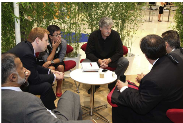
Figure 2 (ESC 3704) Round table discussions at ESC.