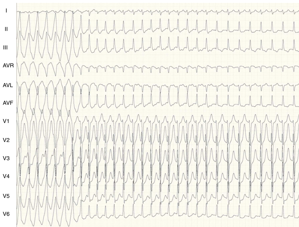
Figure 1 Twelve-lead ECG. In the first part of the tracing a broad QRS tachycardia is shown, with LBBB inferior axis morphology and negative QRS complex in aVL. After this run there is a change to a narrow QRS complex. Surface leads (I, II, III, aVF, V1 and V6), and electrograms recorded from the right ventricular apex and the coronary sinus.