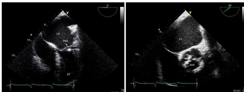
Figure 2 Transesophageal echocardiogram showing vegetation (Veg.) on the ventricular side of the posterior mitral leaflet (PML) and aortic valve (AoV) with thickened leaflets.

echocardiography provided an assessment of disease progression, revealing the regression of the previously observed vegetation.