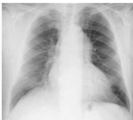
Figure 1 Chest X-ray, showing a slight mediastinal bulge adjacent to the aortic knuckle.

A 63-year-old man presented to the hospital with gradual-onset hoarseness of three months' duration. He had a history of smoking assessed at 58 pack-years, and no other symptoms such as cough, dyspnea or weight loss. His heart rate was 60 beats/min and blood pressure was 159/67 mmHg; the cardiac exam revealed a diastolic murmur in the aortic area. Indirect laryngoscopy revealed a paralyzed left vocal cord in paramedian position. The chest X-ray (Figure 1) showed a slight mediastinal bulge adjacent to the aortic knuckle but no pulmonary mass.