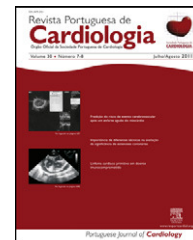
IMAGE IN CARDIOLOGY