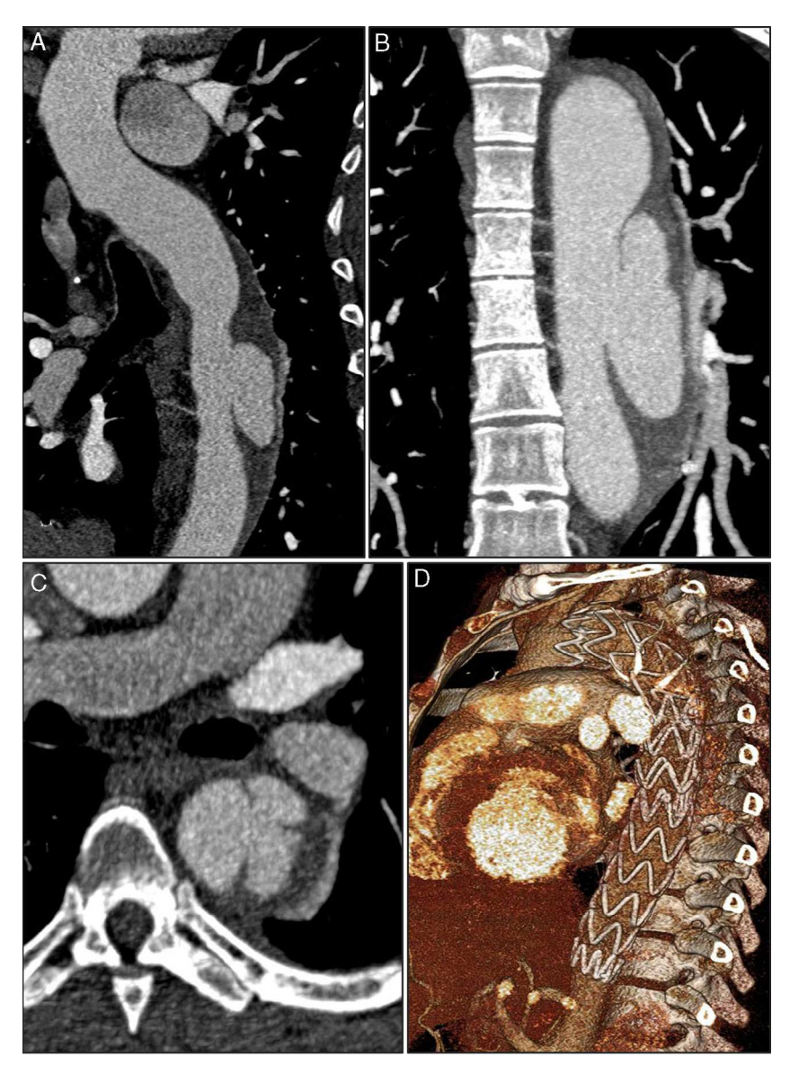
Figure 3 CTA 30 days after discharge, showing evolution of the hematoma to dissection and a pseudoaneurysm measuring 27 mm \times 51 mm in diameter with a 23-mm neck (A, B and C). The pseudoaneurysm was located in the mid segment of the descending aorta, and intimal rupture originated in the aortic wall ulcer that had shown signs of progression on the second exam; three-dimensional volume reconstruction following thoracic endovascular aneurysm repair, showing two overlapping endoprostheses, from the left subclavian artery to the beginning of the abdominal aorta (D).

and transesophageal echocardiography have similar diagnostic accuracy,<sup>5</sup> but CTA is the first-line imaging method for diagnosis and follow-up of IMH. The diagnostic criteria are circumferential or crescent-shaped thickening of the aortic wall of \geq 7 mm and/or evidence of accumulation of blood in the media without intimal disruption or flap formation.<sup>5</sup> On CTA, the thickening appears denser than the blood and adjacent layers of the aortic wall (approximately 50–70 Hounsfield units) and does not enhance after contrast administration.