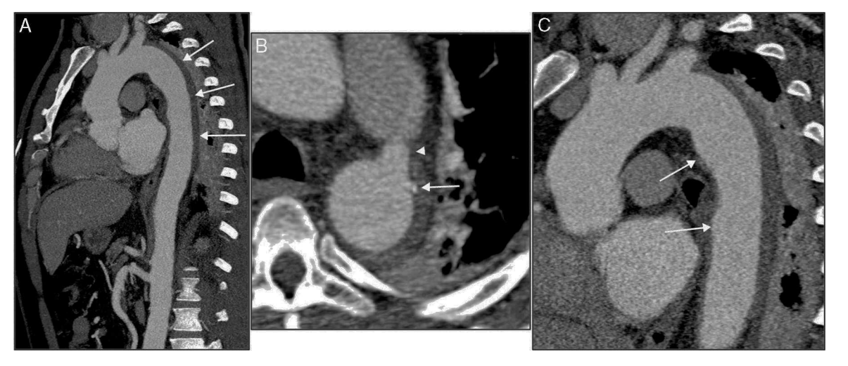
Figure 1 Initial computed tomography angiography (CTA), showing circumferential thickening of the aortic wall (arrows) consistent with intramural hematoma, beginning immediately after the emergence of the left subclavian artery and involving the entire descending aorta and the proximal segment of the abdominal aorta (A); patent ductus arteriosus (arrowhead) and a partially calcified atherosclerotic plaque (arrow) (B); two ulcers in the proximal descending aorta wall (arrows) (C).