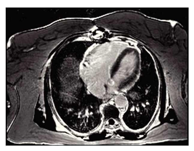
Figure 4 Absence of left ventricular late enhancement.

The patient was discharged asymptomatic on the 20th day. The echocardiogram a month later showed total recovery of left ventricular function but persistence of right ventricular dysfunction.